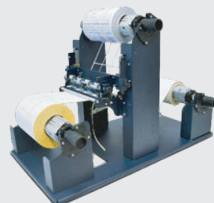
Matrix Remover & Slitter